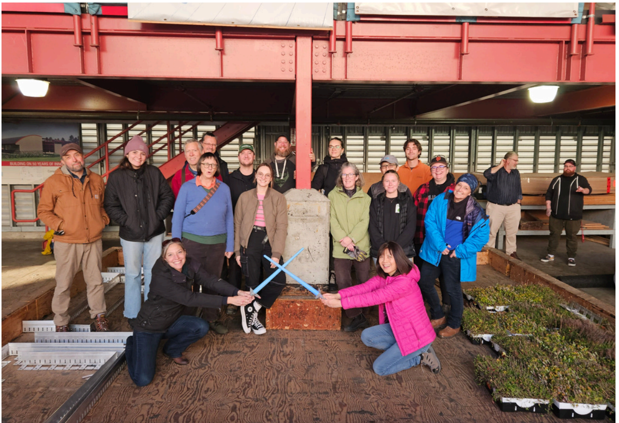
A successful GRIMP class finishing training in Vancouver, November 2023.

In 2023, GRHC conducted four successful hands on training courses across North America in partnership with Ginkgo Sustainability, Recover Green Roofs, New York Green Roofs and RCABC. We trained over 50 people in green roof installation and maintenance principles. Join GRHC in 2024 in Toronto and other locations and become a GRIMP. The GRIMP Training involves a combination of hands-on and presentation style training that introduces the basic skills and knowledge required to install green roofs and maintain them. This training covers a variety of green roof systems providing green roof installers and maintenance professionals with the information, techniques, and training necessary to successfully install and maintain basic extensive green roofs.